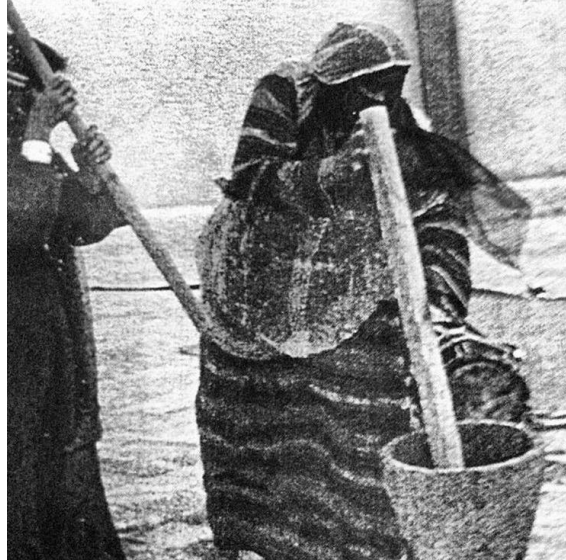
Fig. 1. Womne wheat grinding

Further, percussion instruments are highly popular within the folk music culture of Qatar. Tall clay-like jars called Galahswas were generally utilised as the musical instrument and tin drinking cups called Tasal or tus were also utilised, commonly in alignment with the tabl, which is a drum hit with the assistance of a stick. However, in the modern contemporary period of time, many of the youth in Qatar are highlighted interested in Western and Eastern modern music and the education in the context of music is diverted towards Arabian classical music and Western classical music. This presented scenario may show the overall cosmopolitan lifestyle of Qatar as well as the nature of the people residing in the region, which directly influences their overall musical culture (Harkness, 2020). However, the significant transformation of Qatar has not tackled the overall traces of the marine and Bedouin culture and the orthodox folk music is happening in the nation, similar to various parts of the nation coming to the Gulf region, especially in events and weddings. Moreover, nationalism that shows continuity as well as history, cultural changes, cultural heritage, ethnicity and its overall music wealth heritage and tradition like the seas songs, art of sounds and the dance form of ardha remain in the sole music culture of Gulf (Qatar Tourism, 2022).